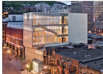
Michal and Renata Hornstein Pavilion for Peace INTERNATIONAL ART AND EDUCATION

1 Decorative Arts and Design Section temporarily closed