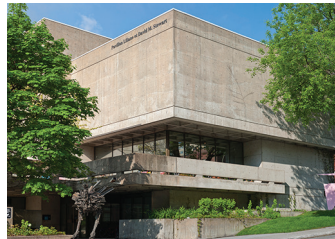
PAVILION Liliane and David M. Stewart DECORATIVE ARTS AND DESIGN

S1 Cinéma du Musée Maxwell Cummings Auditorium Entrance at 1379A Sherbrooke St. W.