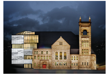
PAVILION Claire and Marc Bourgie QUEBEC AND CANADIAN ART

1 The Salons of the Belle Époque Modern Avant-garde Abstraction and Figuration Contemporary Art Access to the other pavilions