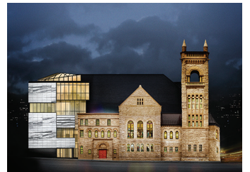
PAVILION Claire and Marc Bourgie QUEBEC AND CANADIAN ART

1 The Salons of the Belle Époque Modern Avant-garde Abstraction and Figuration Contemporary Art Access to the other pavilions