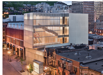
Michal and Renata Hornstein Pavilion for Peace INTERNATIONAL ART AND EDUCATION

1 Decorative Arts and Design Section temporarily closed