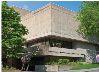
PAVILION Liliane and David M. Stewart DECORATIVE ARTS AND DESIGN

S1 Cinéma du Musée Maxwell Cummings Auditorium Entrance at 1379A Sherbrooke St. W.