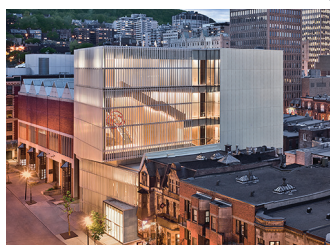
Michal and Renata Hornstein Pavilion for Peace INTERNATIONAL ART AND EDUCATION

1 Decorative Arts and Design Section temporarily closed