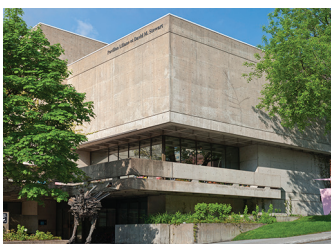
PAVILION Liliane and David M. Stewart DECORATIVE ARTS AND DESIGN

S1 Cinéma du Musée Maxwell Cummings Auditorium Entrance at 1379A Sherbrooke St. W.