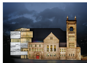
PAVILION Claire and Marc Bourgie QUEBEC AND CANADIAN ART

1 The Salons of the Belle Époque Modern Avant-garde Abstraction and Figuration Contemporary Art Access to the other pavilions