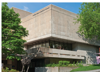
PAVILION Liliane and David M. Stewart DECORATIVE ARTS AND DESIGN